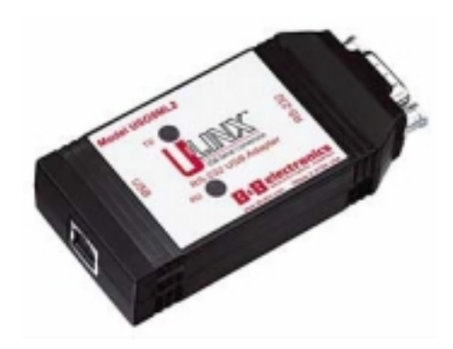
Image of B&B Electronics Isolated USB-RS-232 Serial Interface Converter. Model USO9ML2